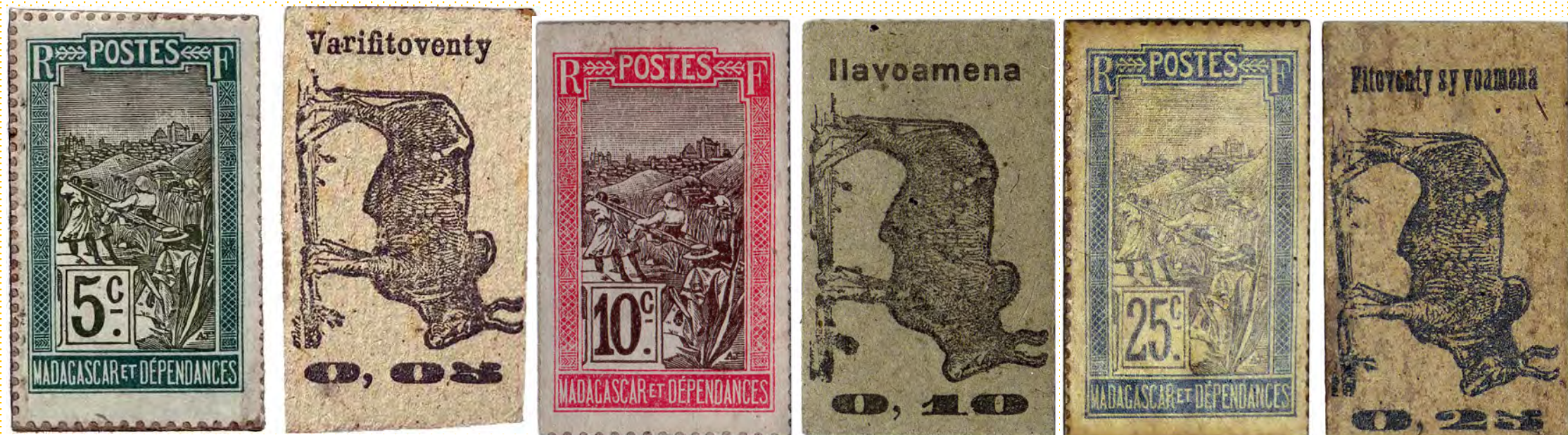
5 centimes green and olive