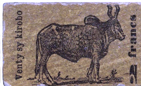
2 francs blue and olive