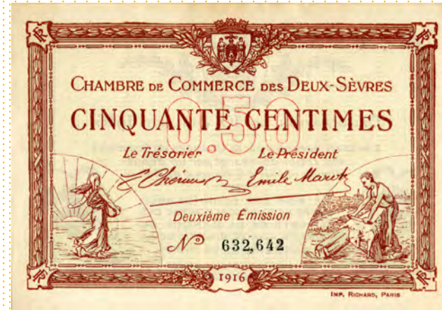
50 centimes banknote issued in 1916 by the Deux-Sèvres Chamber of Commerce (Sower on the left, chamois leather tanner on the right).