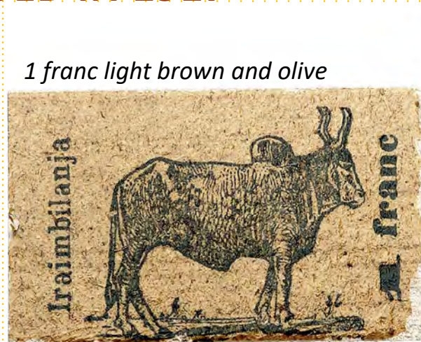
1 franc light brown and olive