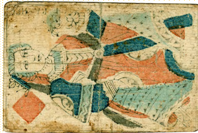
15 Sols trust note issued in 1791 by the Caisse Patriotique de la ville de Saint-Maixent (Deux-Sèvres) on the back of a playing card (queen of diamonds).