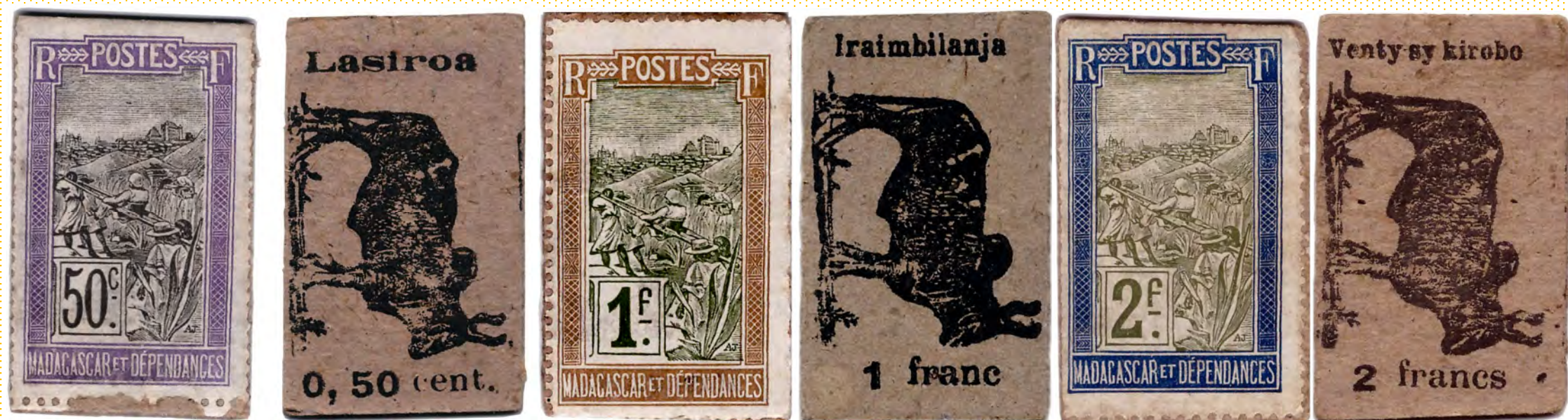
50 centimes violet and black