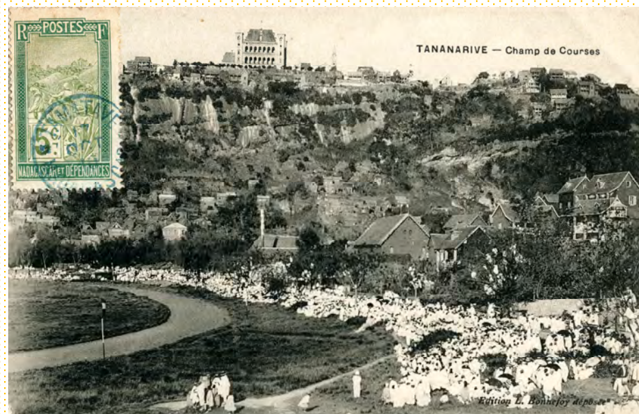
TANANARIVE - Champ de Courses