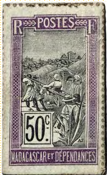
50 centimes violet and black