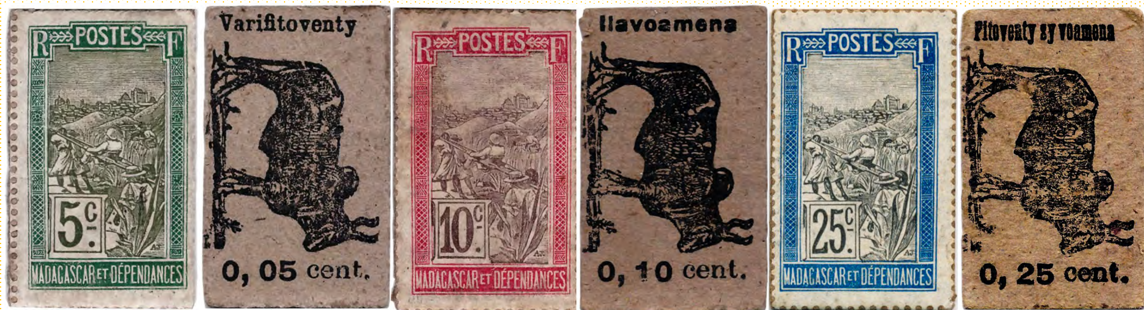
5 centimes green and olive

The designs remained of the “zebu” (omby) type, still for the 6 values of 5, 10, 25 and 50 centimes, as well as 1 and 2 francs, but the numbers and letters were smaller and the mention “cent.” Was added for small values. Learned from experience, these stamps were not varnished.