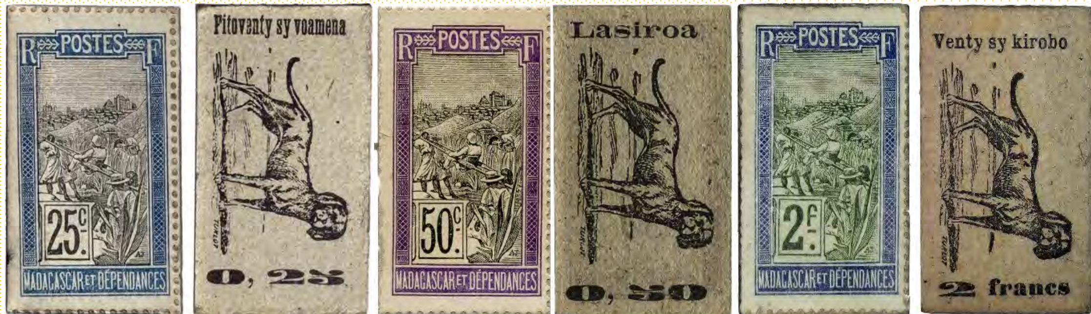
25 centimes blue and black

The values initially retained in the first issue were 25c., 50c. and 2F, as well as 50c. and 1F. The first three were stamps Nos. 101, 106 and 109 "sedan chair ,type".