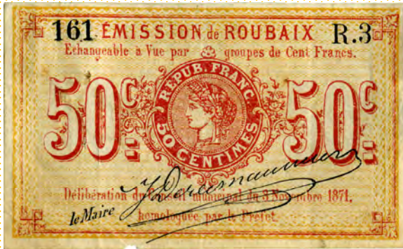
Banknote of 50 centimes issued by the Municipal Council of Roubaix on November 8, 1871 (approved by the Prefect).

This had already been done during periods of crisis after the defeat of 1870