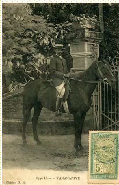
Type Hova - TANANARIVE